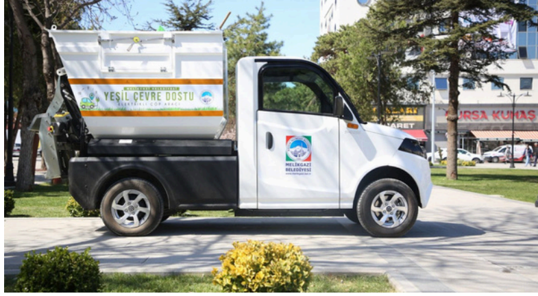
Fully-Electric Garbage Truck (2024)