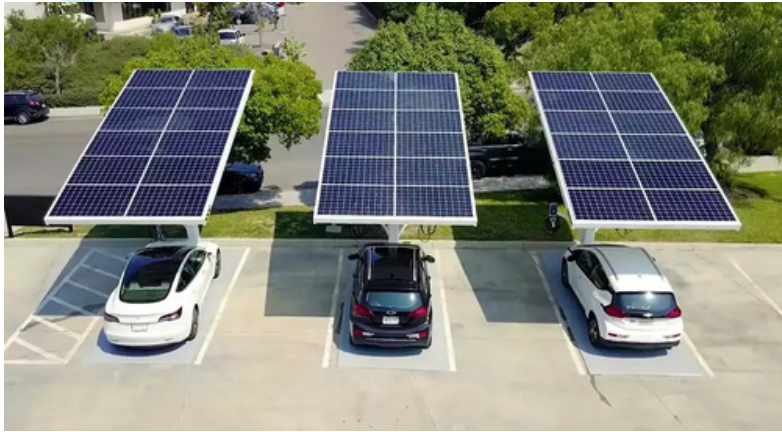
Solar City Project (2024)