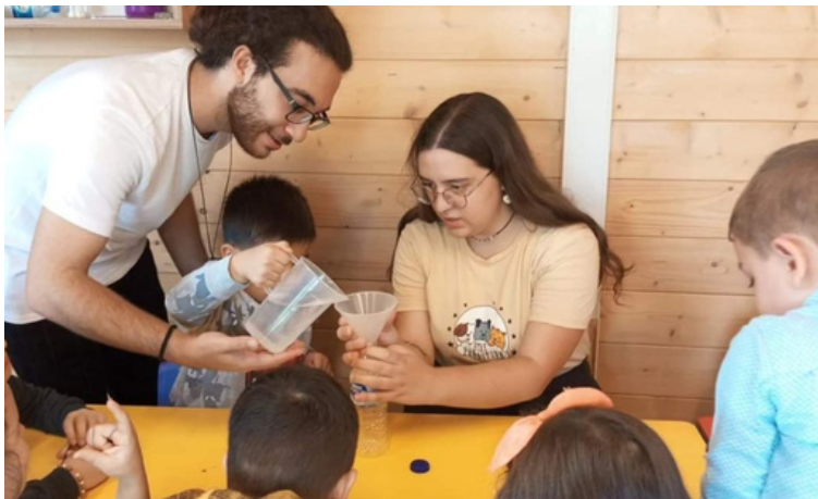
ECOLOGICAL PARK FOR CHILDREN (2023)