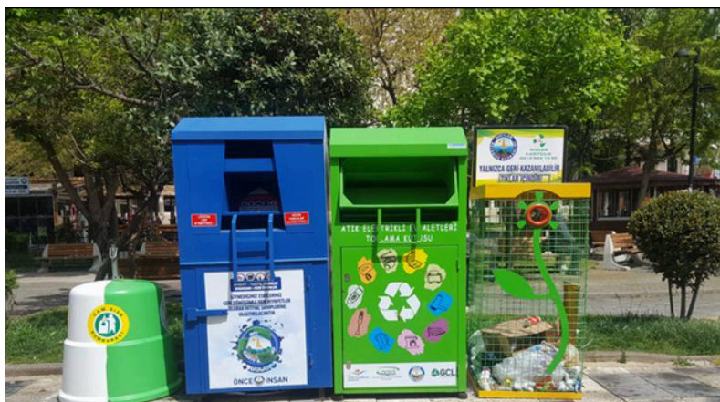
ZERO WASTE DUAL COLLECTION SYSTEM PROJECT (2023)