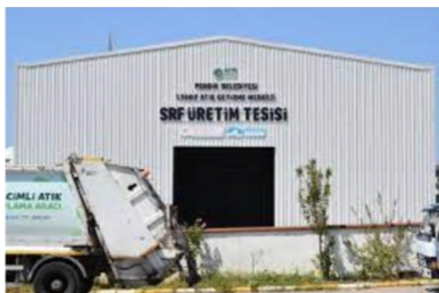
Waste derived fuel plant SRF Plant (2022)