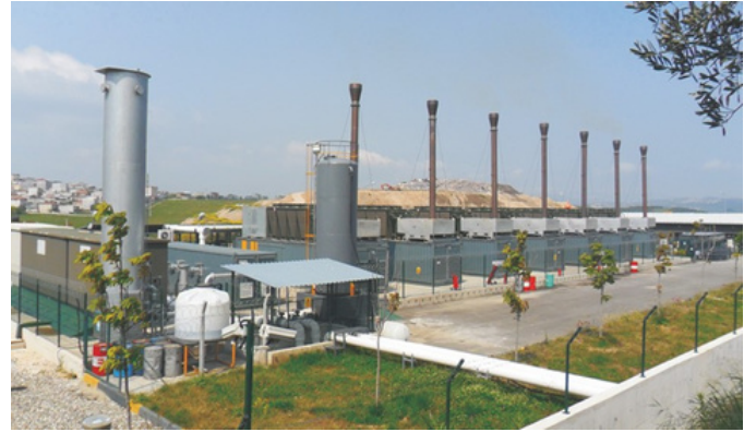
Urban Solid Waste Storage Area